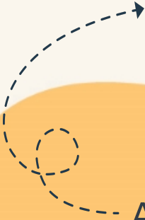
Alight mobile app.